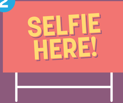
"H" FRAMES & SELFIE SIGNS